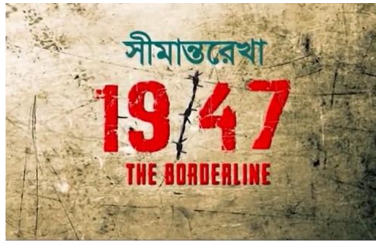
Fig. 3. Title Card of Seemantorekha

Swapnabhumi (The Promised Land) is a documentary film produced in 2007 on the Urdu-speaking Bihari Muslim residing in Bangladesh who left Bihar for East Pakistan during the partition with the hope of a dreamland. After twenty-three years of partition with the breakdown of Pakistan, these people become stateless and known as refugees or stranded Pakistani in Bangladesh. How their disillusioned life without citizenship is going on has been passionately presented in this film. In Fig. 2, the Bihari children who born in Bangladesh dream for this country. Their hope and future are tied with this birthland. Their urge to be recognized as Bangladeshi.