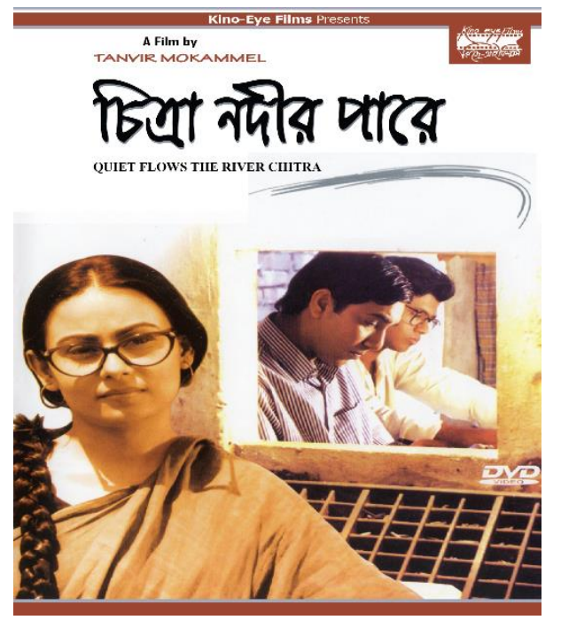
Fig. 1. The poster of Chitra Nadir Pare

called religious nationality was replaced with Bengali ethnic and linguistic identity called 'Bengali nationalism' (Ghoshal 1). The most unfortunate thing about partition is that its horrific impact on the people of this region is long-standing. Many things are yet unsettled and unresolved. The crisis of statelessness, identity, and citizenship, the rights and the recognition of the land, language, and culture, barbed wire, and border killing are severe concerns as humanitarian issues that are the by-product of partition. Many of the people in these three countries India, Pakistan, and Bangladesh are still suffering from the present struggle bearing with historic trauma.