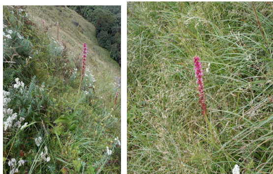
Figure 1: Satyrium nepalense var. ciliatum in its natural habitat

The study was conducted at Deorali pass, above Nangethati, Kaski. The study site is a large open meadow distributed from 2700 m - 3200m, and is located within the Annapurna Conservation Area. This meadow is extensively exploited by the local residents of Nangethati as a pasture land and harvesting grasses and other valuable herbs for their traditional subsistence.